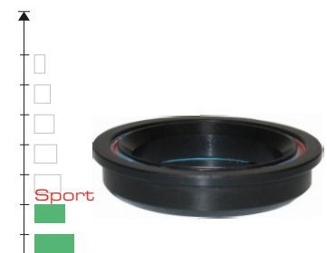
Monobloc Cup cartridge (Raz « ST » model)