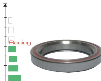
Annular bearing (« Ca » & O'Light models)